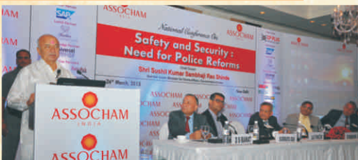
Shri Sushil Kumar Sambhaji Rao Shinde, Hon'ble Home Minister, Ministry of Home Affairs Government of India Inaugurating the Conference

The current Conference would aim at involving policy makers, implementation agencies, experienced security professionals and the industry to showcase and discuss their expertise available in the security and surveillance domain. It would discuss (and exhibit in the parallel) cutting edge technology, equipment, challenges (financial and technological), the political effort and the best practices world-over in the domain of security and surveillance. It will also provide a networking platform to engage stake holders in security from the Govt., public and private sectors and industry to benefit from a possible symbiotic synergy.